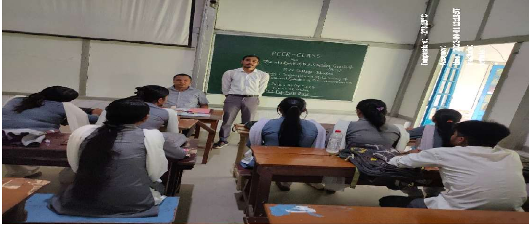
Students of B. A. 5th Semester Honours Class attending the class